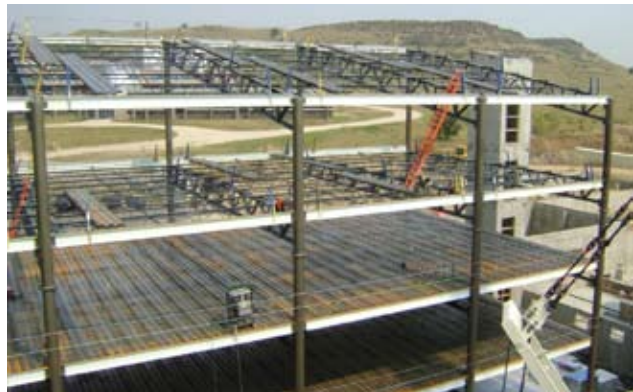
Figure 2: Reclaimed Pipe columns at the NREL Laboratory in Golden, Colo.