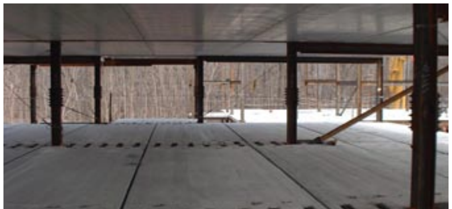
Unobstructed ceilings with Girder-Slab system.