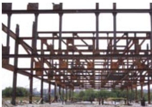
Column-free lower level.