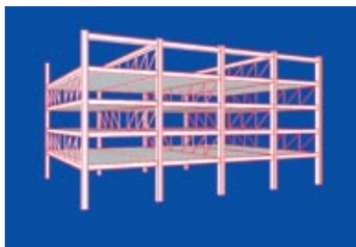
Schematic view of the staggered truss framing system.

Room layout and spacing often dictates which type of floor slab to use. A main consideration is whether to have the slab span from demising wall to demising wall or from perimeter to corridor. Spanning from perimeter to corridor creates a very flex-