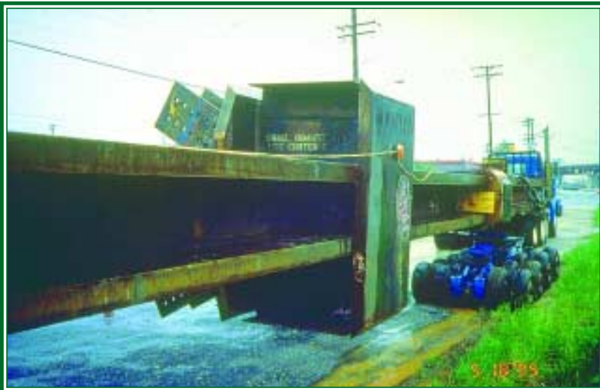
One especially large truss required special handling. This 100'-long, 16'-wide, 104-ton member was too large to be transported to Baltimore by conventional trailer. Instead, it was fabricated at the Bethlehem Steel Co. plant in Sparrows Point, MD, and mounted on a special dolly with 90 airliner landing wheels. It was moved through the city streets between midnight and 3:00 a.m., requiring three nights to travel the 16 miles to the site.

the large connections invalidated the normal assumption of pin-ended members for truss design. As a result, truss joints were analyzed and designed assuming full continuity. Where the second order effects resulted in excessively large bending moments in some truss members, special pin details were introduced to relieve the moments in these locations.