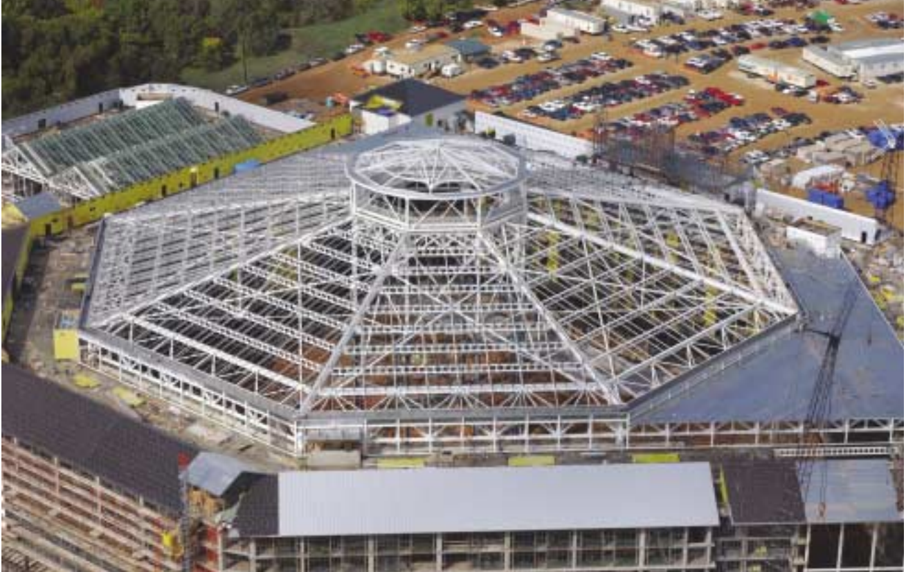
Cellular steel beams add a visually pleasing rhythm to the complex geometry of the central atrium.

The erection aids consisted of tabs welded to the ends of the connecting members, which were temporarily bolted together to hold the members in correct alignment for field welding. After the connections were welded, each erection aid was removed, followed by grinding and touch-up. Due to the accurate placement required to ensure correct field alignment, Hirschfeld, Consteel, and PBI utilized the XSteel model to establish the location of each erection aid. Shipping constraints, raw material lengths, and erection sequences occasionally required this to be an iterative process.