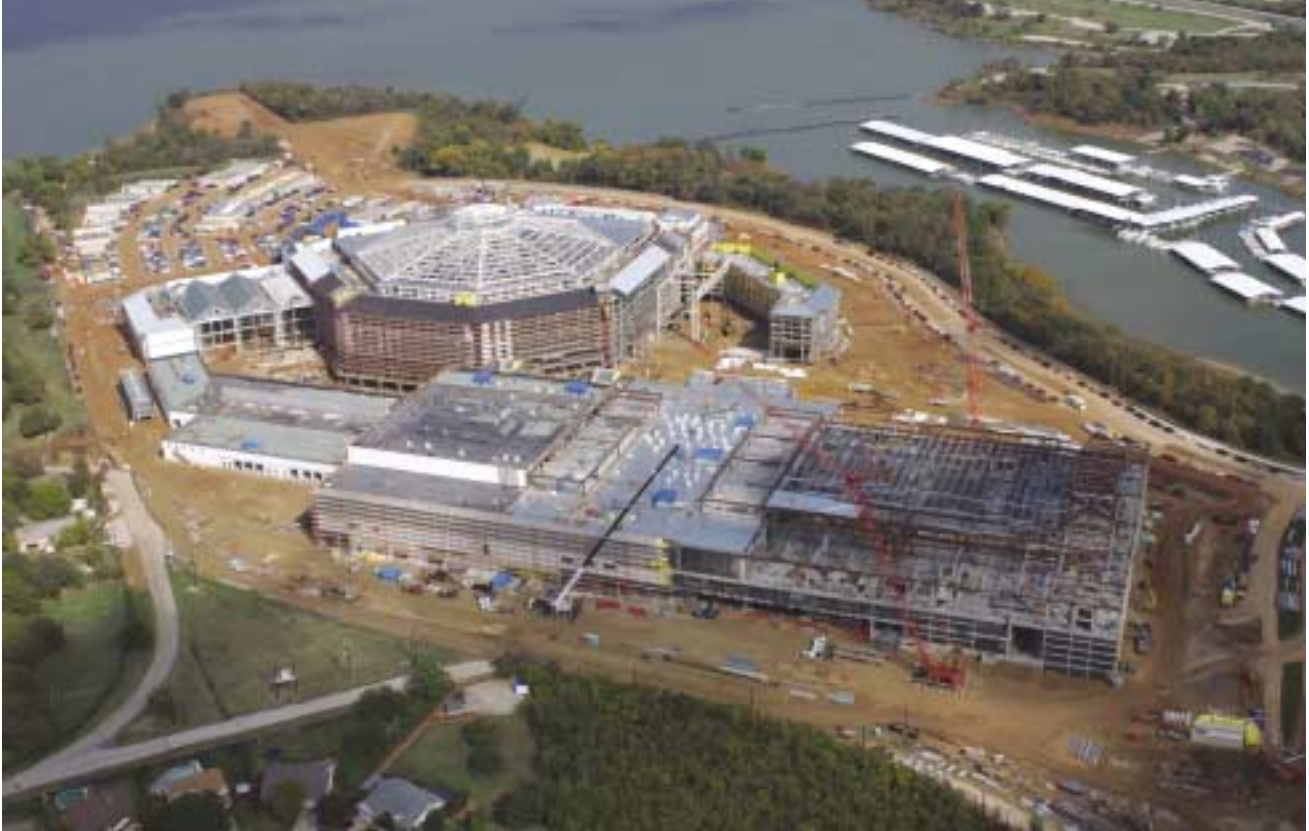
The Gaylord Opryland Hotel Texas, on the shores of Lake Grapevine near Dallas, features a two-and-a-half-acre atrium in the center of the hotel flanked by two smaller atria, each slightly less than one acre in area.

ondary framing. The central octagonal “hub” of the space frame consists of a perimeter tension tie at the base with a compression ring at the main roof level. The only framing inside the perimeter of the hub is the cupola roof at the top—a smaller space frame whose members form a 72’-diameter “Lone Star.” The complete framing system is described in detail in the adjacent box.