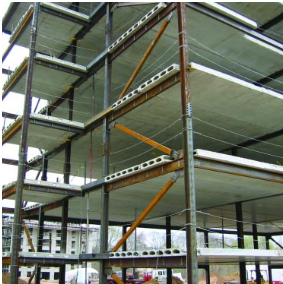
Typical columns are W8×48. The lateral bracing system combines diagonal braces and moment frames.