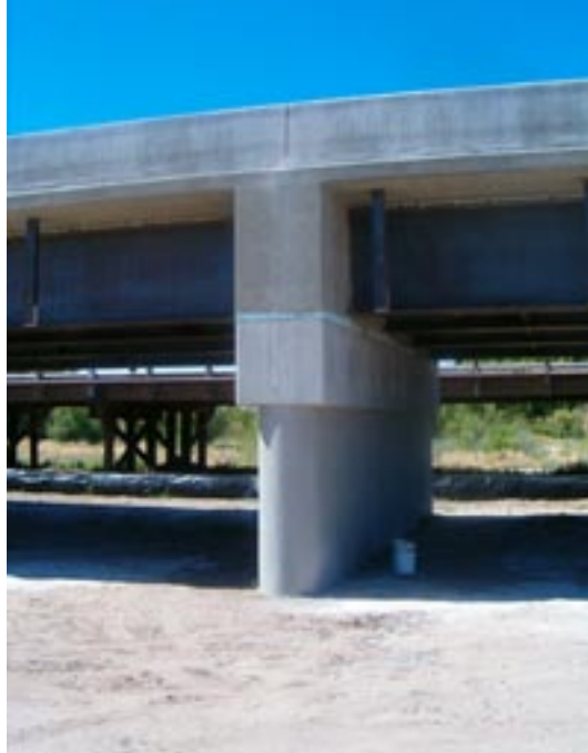
Figure 3. A connection plate bolts the top flanges of the two girders that meet at a pier, making the girders continuous for live loads.