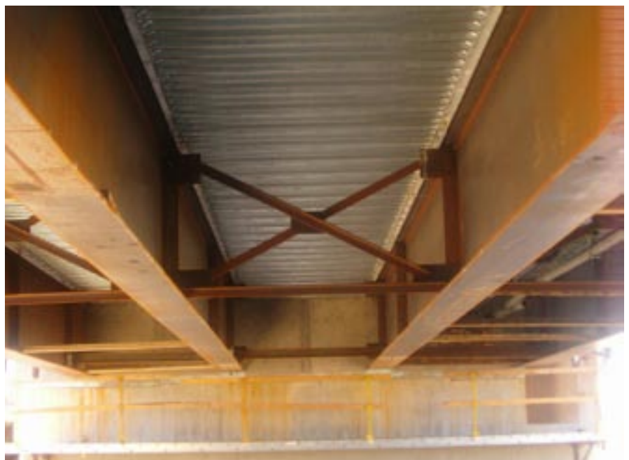
Figure 1. Dual-design analysis indicated that steel required only four girders, while concrete pre-stressed beams required five (for the same depth).

New detailing ensured that the top plate connecting in-line girders at the piers would slip properly under DC1 construction loadings, allowing beam-end rotation. By contrast, on the US 70 project the contractor placed the deck and pier diaphragm in one continuous pour. Construction workers had to tighten all top continuity plate connection bolts before slab pour because of their location inside the concrete pier diaphragm. This induced some level of stress throughout the beam. The shear resistance of neoprene bearing devices induced these forces, which are caused by beam-end rotation under deck pour loadings.