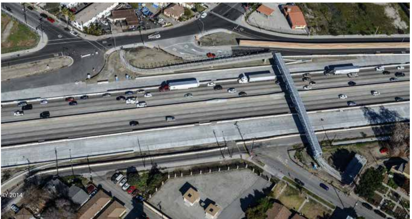
▼ The bridge accommodates a widened I-10.