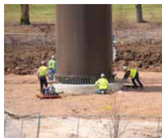
▼ The bottom two sections are straight 11-ft-diameter cylinders.