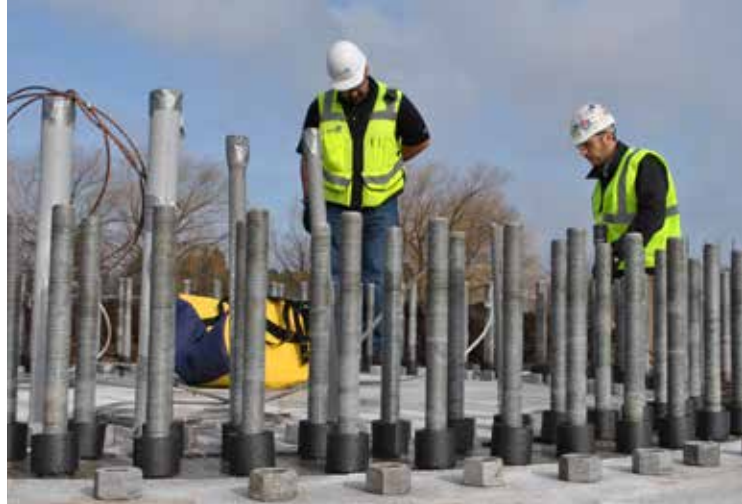
▲ There are two rows of 72 radially arrayed 1½-in.-diameter threaded anchor rods.

Upon determining the required size of the flagpole to resist the along-wind forces, the next design step involved performing a detailed assessment of the flagpole's susceptibility to be dynamically excited in the cross-wind direction due to the phenomenon called vortex shedding. It was determined that for wind speeds in the range of 10 mph to 35 mph, the first three modes of vibration would be excited in the cross-wind direction. The design required these motions to be suppressed because: The wind speed recurrence intervals are very low; the amplitude of motions would be visible to onlookers and; the many repeated cycles of vibration on the pole would cause metal fatigue failure well before the intended 50-year design life of the pole is achieved.