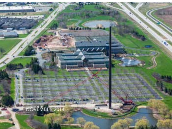
▼▶ The pole tapers from 11 ft in diameter at the bottom to less than 6 ft at the top.