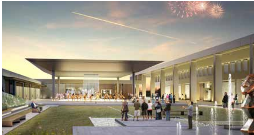
All images: Avci Architects

Transportable steel elements are the long-span, long-distance solution for a new conference facility near the Congo River.