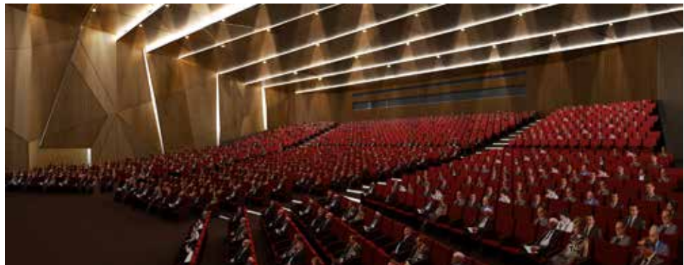
▲ The congress hall will host meetings of the African Union. ▼ The foyer of the presidential hall.